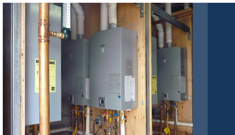
Replacement of old water heating system with ten intelligent cascaded Bosch Greentherm gas condensing tankless water heaters - example of cascade flow diagram shown below.

Heneghan Plumbing was able to keep the existing hot water system running while installing the new system, and Colin added that "the changeover was a lot easier than we ever expected. We found the Bosch units easy to install, program and troubleshoot. It was made simpler with support from Bosch Sales Representative Dan McDermott and Craig Porter from Bosch technical support."