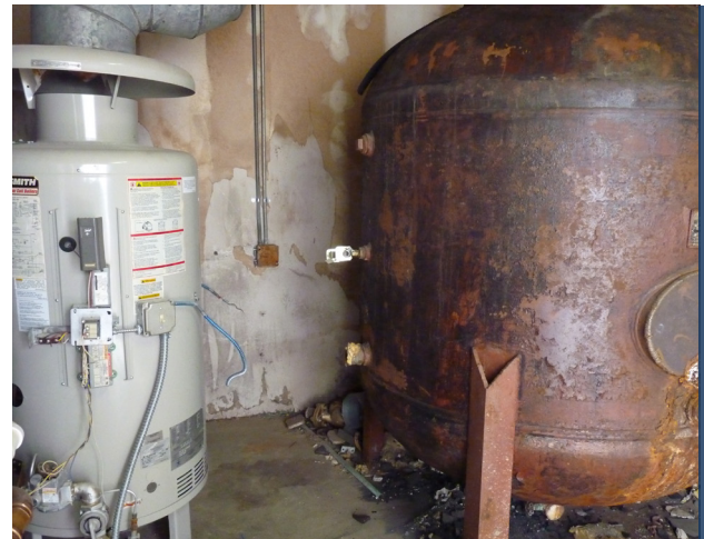
Old gas-fired boiler (left) fed domestic hot water into 500-gallon storage tank (right).

The hotel owner reported fuel savings of approximately $1,500 to $2,000 per month in the first six months of operation. Compared with a competitive tankless installation at a similar hotel with same number of rooms, this Bosch installation saved about $500 more per month.